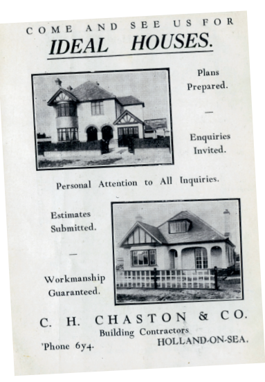
C. H. Chaston promotes his property development in 1931.

the seaward side of the (now) Frinton Road and provided a picturesque scene of suburban tranquillity, renowned for its attractive front gardens and peaceful way of life. Building work on the landward side of Frinton Road, the Preston Park Estate, had been at a much slower pace, as the land dropped down to Pickers Ditch with great clumps of blackberry bushes, brambles and overgrowth intermingling amongst the limited properties. However, a complete development along Slade Road was underway in 1964, although even then the road was still unmade and delivery lorries suffered a similar fate to their predecessors. Also in the 1960s behind the Oakwood Public House, which itself was part of Kents Farm, came the building of the Kents Farm Estate, opened by actress Jill Ireland who, at the time, was married to television's The Man from UNCLE's David McCallum and went on to marry American actor Charles Bronson.