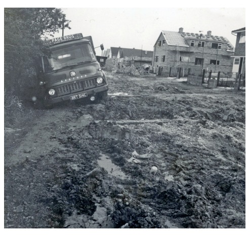
It's 1964 and a lorry sinks up to its axle whilst delivering to the building of Slade Road properties.

appreciated – from the modest little wooden bungalow to the "Dutch" style houses, a glimpse of 1930's art deco, and the substantial row of red brick former council houses; all these variations making-up the uniqueness of our village.