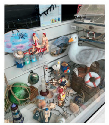
Birthday Gifts Father's Day New Baby Birthdays Anniversary's Or just Because!

Many occasions catered for and elegant bespoke items for the home.