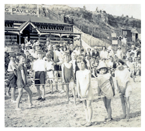
Organised games for the children in front of Johnston's Bathing Pavilion.

in clinker rowing boats, all supplemented earnings. Modest fees were charged for changing facilities, and even entering the beach area and swimming would be charged for. Children's games were organised on the sands, along with sandcastle competitions and beach cricket, and displays of physical fitness would be put on by such groups as the Holland on Sea Health and Strength Club.