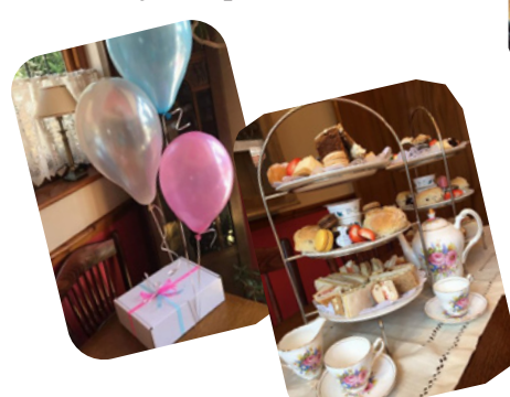
Gíft Vouchers Avaílable Too

Visit us or have delivered to your home for any occasion. Variety of options available.