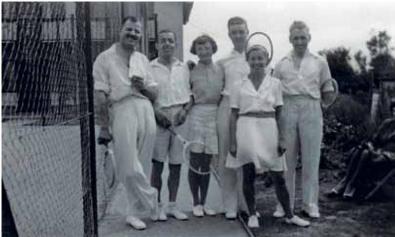
Those 'bright young things' asking "Anyone for tennis?".

build a pavilion on the seaward side of the tennis courts never materialised and, like life in general, the holiday industry was totally disrupted by the Second World War and things would never quite be the same. Some years later the chalets were sold as private residences, the tennis courts removed and garages