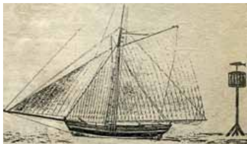
The "Viper" of Harwich; its purpose was to keep a watchful eye on smuggling. It has just sailed past the Gunfleet beacon, a predecessor of the Gunfleet Lighthouse that still remains, disused, off our shores.