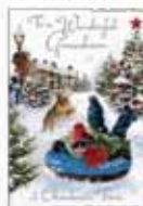
All New 2022 Christmas Cards