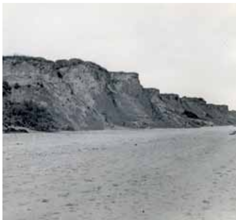
This is a 1930's picture of the rough cliffs at Little Holland; typical of a long stretch of desolate seashore of the 18th century.

If we go back to the days of Little Holland in the 18th Century, the area was made-up primarily of farmland, with just a few dwellings for the workforce. This was long before David Cripps Preston had a vision for a residential development that we now know as Holland on Sea, and then there were at least two areas that did attract the