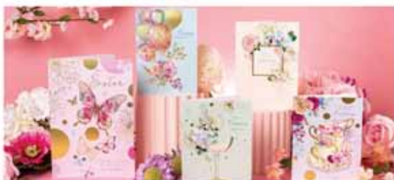
Best Quality Greeting Cards in Town