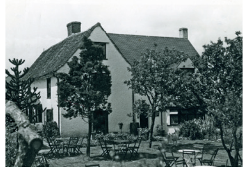
Kents Farmhouse, following the closure of the farm, and here in 1952 operating as The Oakwood Hall 15th Century Guest House and Licensed Club.

war. As the 20th century marched on so farmland was turned over to residential development and the farmhouse, along with its associated farm buildings, was demolished in 1933.