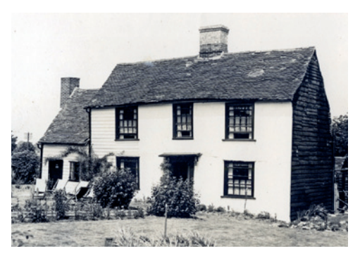
The farmhouse to Turpins Farm that was situated where Turpins Court now stands on the Holland Road.

Kents Farm is the only one to still have a presence in Holland on Sea as the farmhouse survives as The Oakwood Inn public house. In 1811 it was known as Ransoms when the estate was described by an auctioneer, with some exaggeration, as "surrounded by good roads, is pleasantly situated with ¼ of a mile of the shore in Little Holland, and very conveniently for shipping corn, and carting manure; it is bounded on the sea side by a very lofty and beautiful cliff; commands an extensive view of the