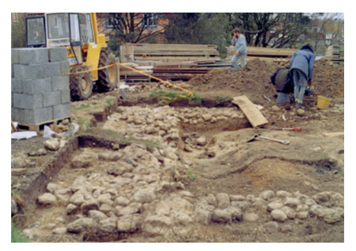
Local archaeologists, in the late 1980s, expose some of the foundations of the original church on the site of Little Holland Hall; parts of which date back to the 11th - 12th century.

William the Conqueror, back in 1085, commissioned the Domesday Survey in order to assess the wealth and assets of his subjects and so raise taxes to pay for his army, and in this not insignificant book is recorded the settlement of Hoilanda, and comprising of some 18 families, with a manor (roughly where Little Holland Hall now stands). Its recorded history is that of a little farming community situated at an isolated coastal village on a promontory and linked only with Great Clacton; its inhabitants benefitting from the use of the Gunfleet Haven, a small natural harbour, which subsequently silted-up and was, in the 17th century, spanned by a sea wall. By 1428 the number of families had fallen to 10, and in 1662