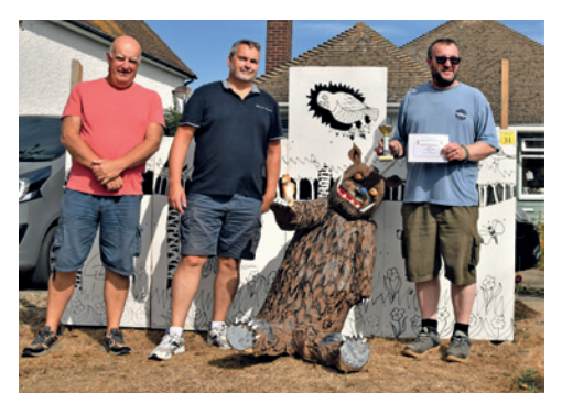
People's favourite : 'The Gruffalo', 17 Haven Avenue.