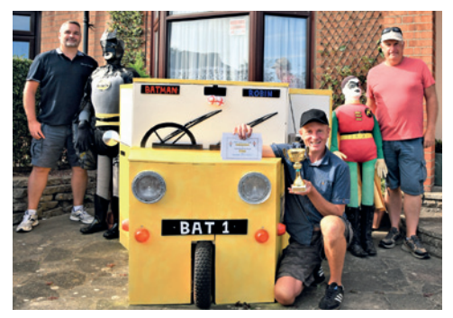
Houses: 'Batman and Robin', 5 Windermere Road.