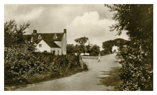
Some halfway down York Road, looking towards the Frinton Road, with Bennetts Farm on the left.