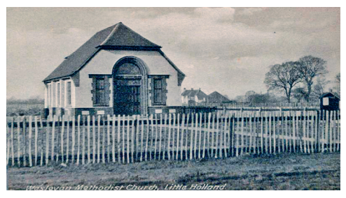
The Wesleyan Methodist Church on the corner of Kings Avenue and Preston Road, shortly after its opening.

Little Holland's third church was to arrive in June 1934 when, in a tent opposite Kenilworth Road, the first Baptist service was held. The accommodation progressed to an asbestos clad bungalow in 1935 on the corner of the Holland Main Road and Norman Road and the building was known as Beulah