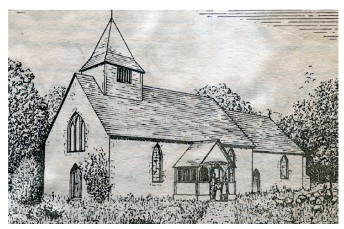
A drawing of what the Little Holland church might well have looked like in the 16th century.

In Cromwell's days it was reported that there were just eight families in the parish and in 1683 it was recorded that "the Church is adowne and has bin downe for about 24 yeares". In 1696 it was further recorded that the church had been "for at least these forty years demolished and the place almost eaten up by the sea....and that the inhabitants of Little Holland do now repair to Much Clackton...". The three bells had been lowered to the ground and