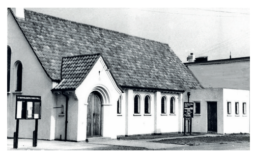
The second St. Bartholomew's, serving Holland on Sea from 1929 to 1972.