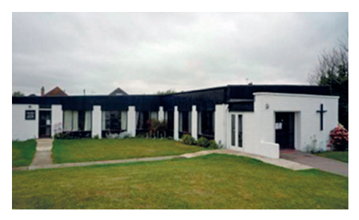
The most recent church to arrive in Holland on Sea, All Souls Roman Catholic, was also the first to close.

Baptist Mission Hall; the present church being built in 1955.