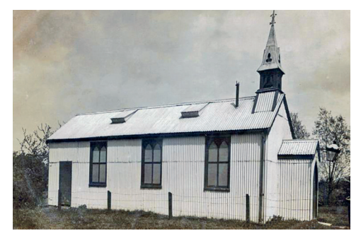
Holland's "tin church" - the first St. Bartholomew's.

left in the adjoining farmyard but later removed to Great Clacton.